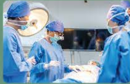
Medical treatment or procedure