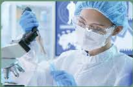
Scientific research or experiment