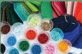
For resell purpose