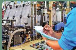
For manufacturing process